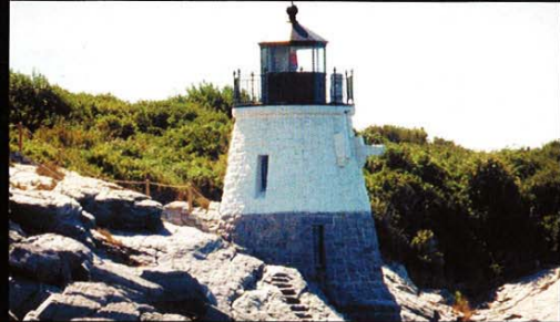
Castle Hill Light in Newport, Rhode Island.